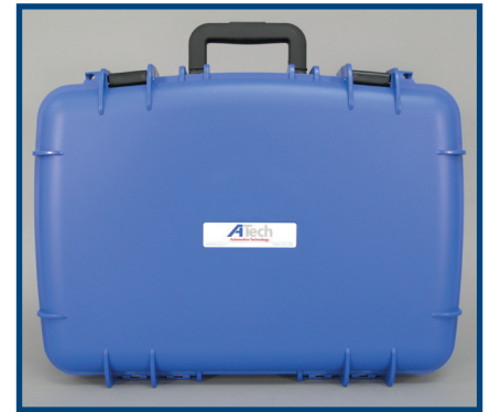
Includes: Clear Case Relay & Socket 500-008-006

The Electromechanical Trainer contains the following components and capabilities: