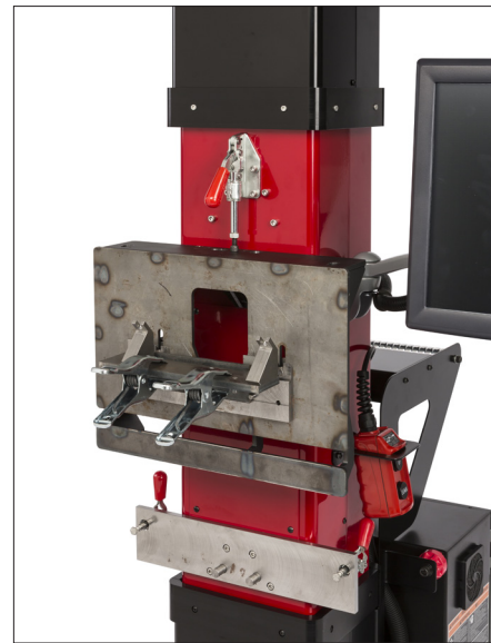
Table Position 2 Position: Overhead