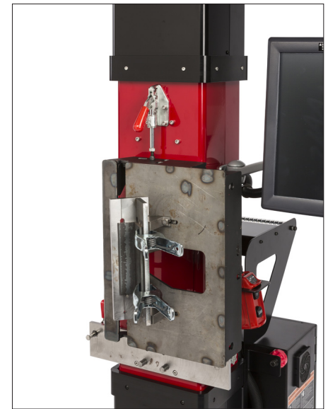
Table Position 3 Position: Vertical