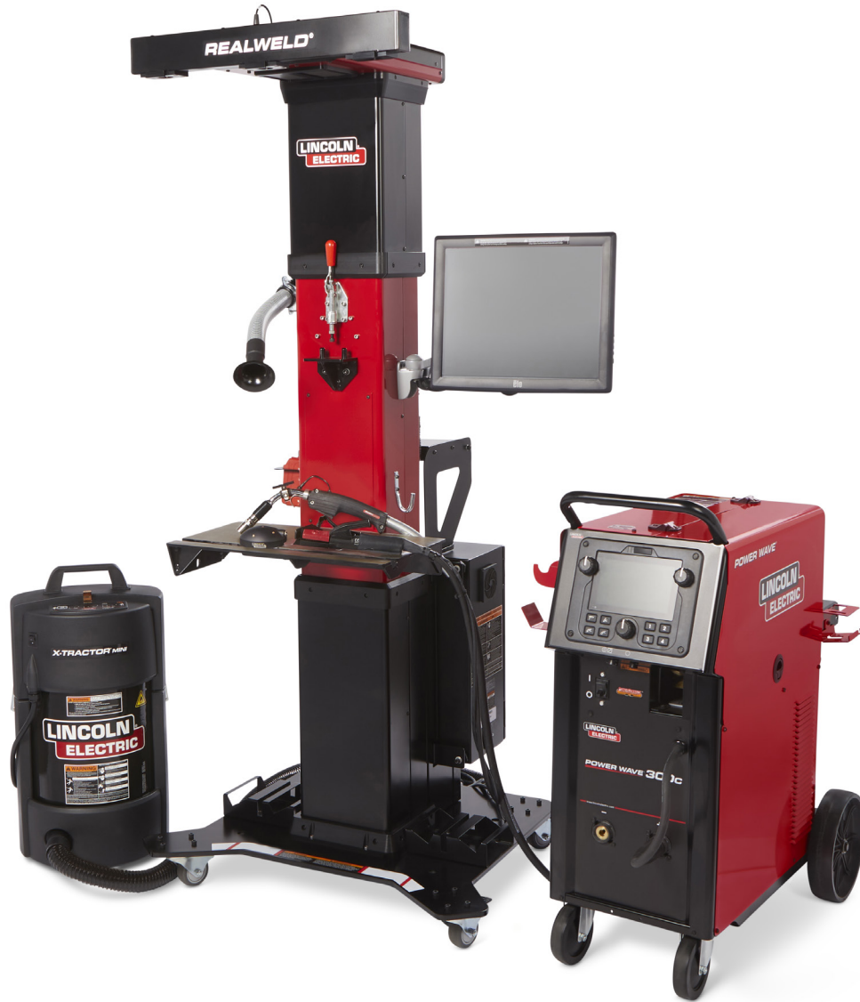
K4344-6 One-Pak® Package Shown