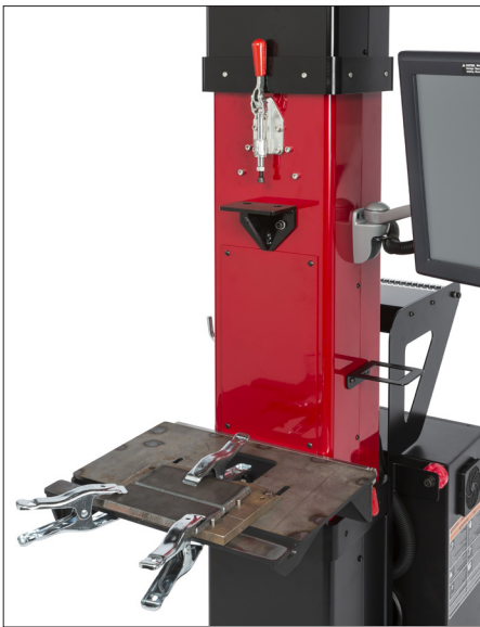
Table Position 1 Position: Flat

REALWELD Trainer teaches multiple welding processes in a number of welding positions (1F, 2F, 3F, 4F, 1G, 2G, 3G) and joints (lap, tee, groove, flat plate).