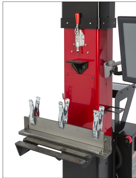
Table Position 1 Position: Horizontal